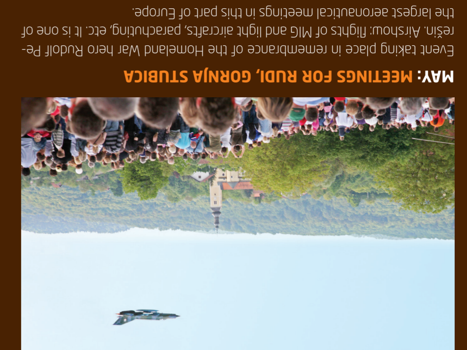
MAY: MEETINGS FOR RUDI, GORNJA STUBICA Event taking place in remembrance of the Homeland War hero Rudolf Perešin. Airshow: flights of MiG and light aircrafts, parachuting, etc. It is one of the largest aeronautical meetings in this part of Europe.