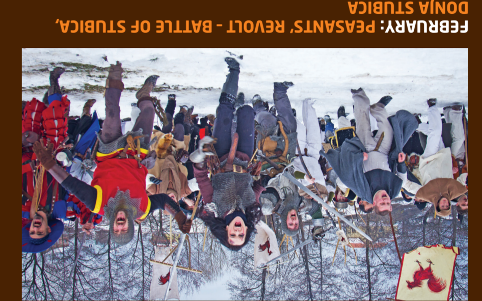
FEBRUARY: PEASANTS' REVOLT - BATTLE OF STUBICA, DONJA STUBICA The main event, the Battle of Stubica, staged by the extras dressed in mediaeval costumes as feudal lords and peasants, armed with swords, cannons, pitchforks, spears, and sticks - faithfully displays the final battle at the field of Stubica.